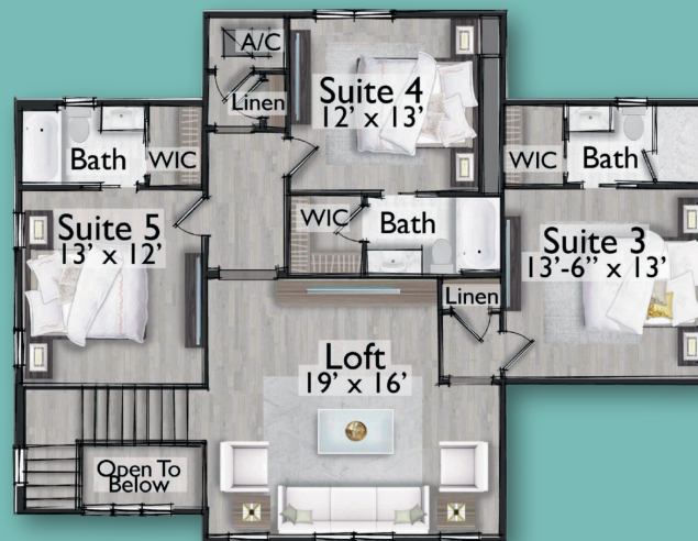
FIFTH BEDROOM/BATH + LOFT