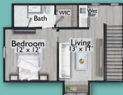
GARAGE BONUS ROOM